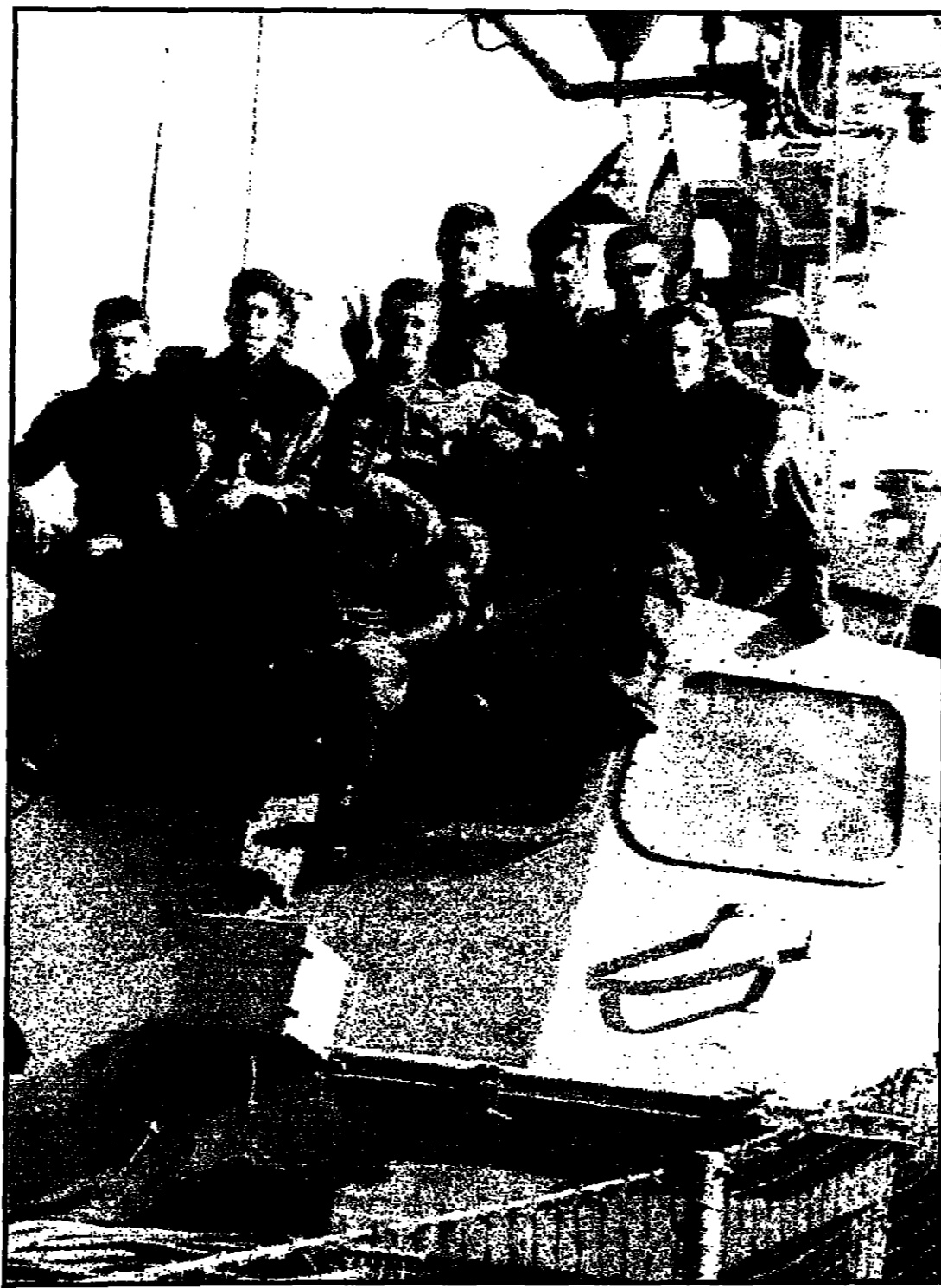
Crew members of the Dvora-class patrol boat pose yesterday in Haifa after their successful mission off Lebanon.

was apparently done by the Allies to limit the genocide. Most of the executions were carried out by German police units, known as Ordnungspolizei, or "Orpo," in conjunction with the SS. The Germans clearly feared that the messages might be intercepted and executions were therefore classified under the euphemisms, "Cleansing Operations" and "Action According to the Usage of War." The decoded messages showed that victims were described as Jews, Jewish plunderers, Jewish Bolsheviks and Russians soldiers. According to the messages, hundreds of thousands of Jews were rounded up and systematically slaughtered in the months following the German invasion of the Soviet Union. The British intelligence branch responsible for intercepting wartime German messages has already released a large number of documents, the existence of which were revealed only in the early 1980s, but intercepted messages of the Ordnungspolizei have been retained until now. It is believed a decision was taken to release them because copies of some documents were unclassified by the US last year, provoking charges of a British coverup. Evidence of the scale of the Holocaust is contained in an appendix of "British Intelligence in the Second World War," the official war history by Professor Sir Harry Hinsley and three co-authors. According to Hinsley, the British code-breaking teams reported references to Dachau, Buchenwald, Auschwitz and seven other concentration camps from the spring of 1942 to February 1943.